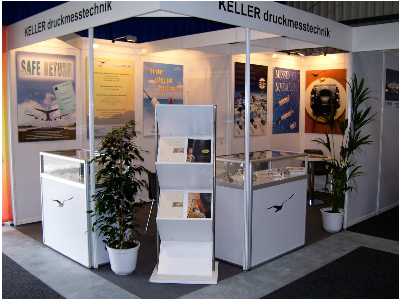
SensorEngineering on Booth of Keller AG